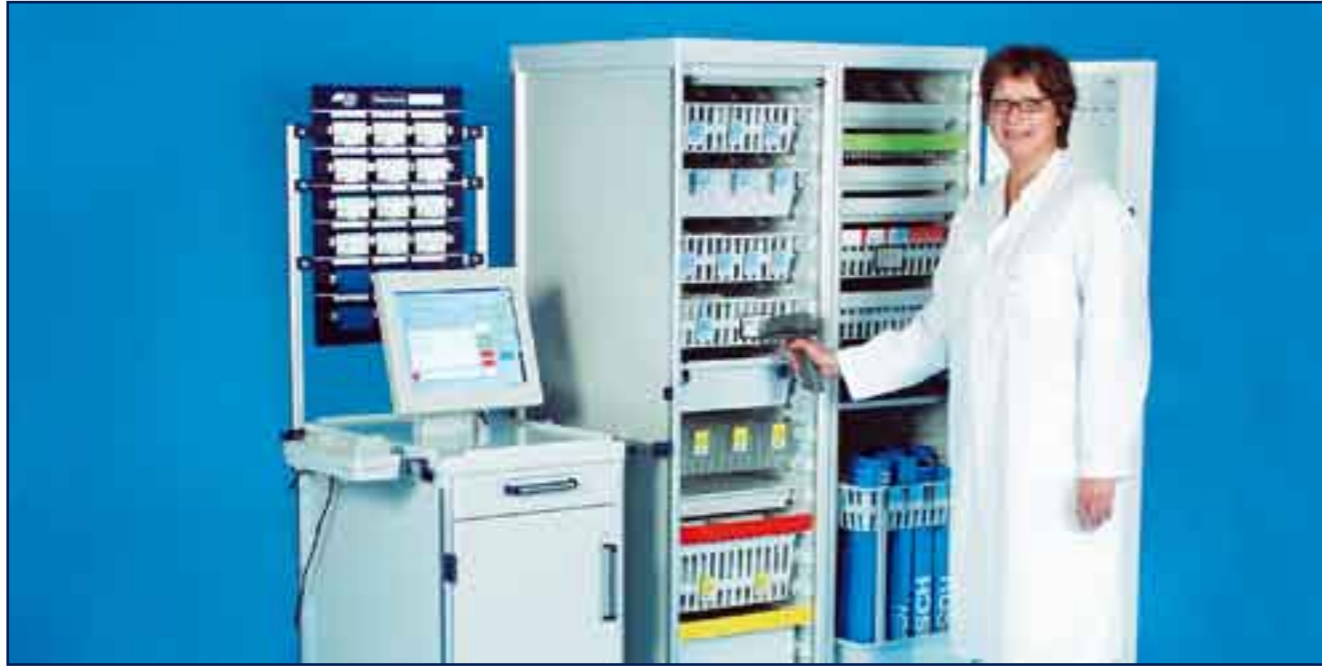
Logistical systems and products for hospital materials management